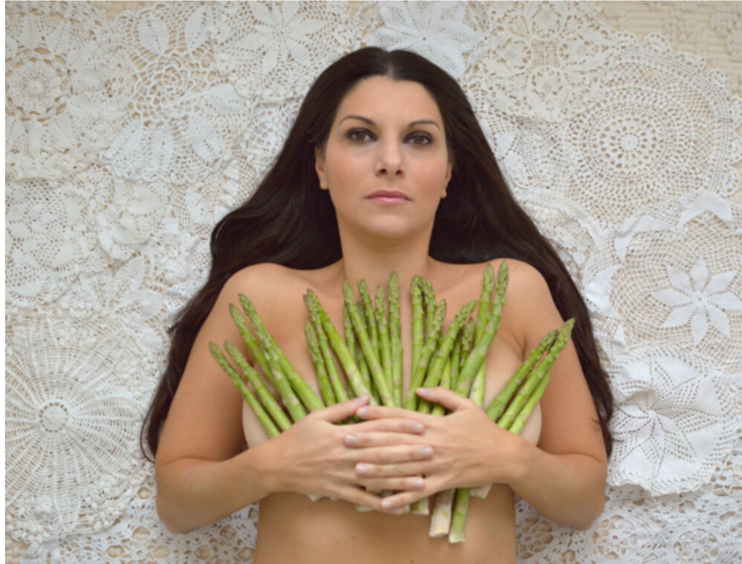
Photo and installation for a private collector The artist's body becomes a still life which is performed.

NATURA Less is more Galerie du CROUS Paris 2018