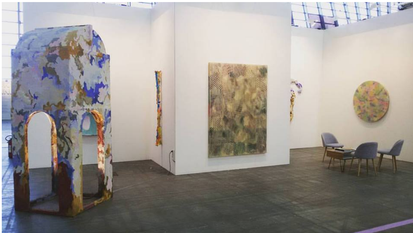
Thomas Brambilla Gallery.